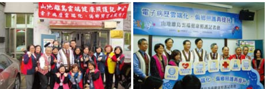
86 87 2012年十二月四日山地離島雲端健康照護記者會。 Press conference on cloud based health care for mountainous and offshore areas on December 4, 2012

美醫院與高雄長庚醫院兩大醫學中心的資深心臟內科醫師，每日不間斷支援，並且協助護理及醫事人員的訓練。 透過醫療團隊的合作，截至2014年五月，已完成六十例治療。過去此類個案必須經由空中轉診救治，實施這項措施之後，能在黃金時間內搶救人命，並且節省千萬公帑。